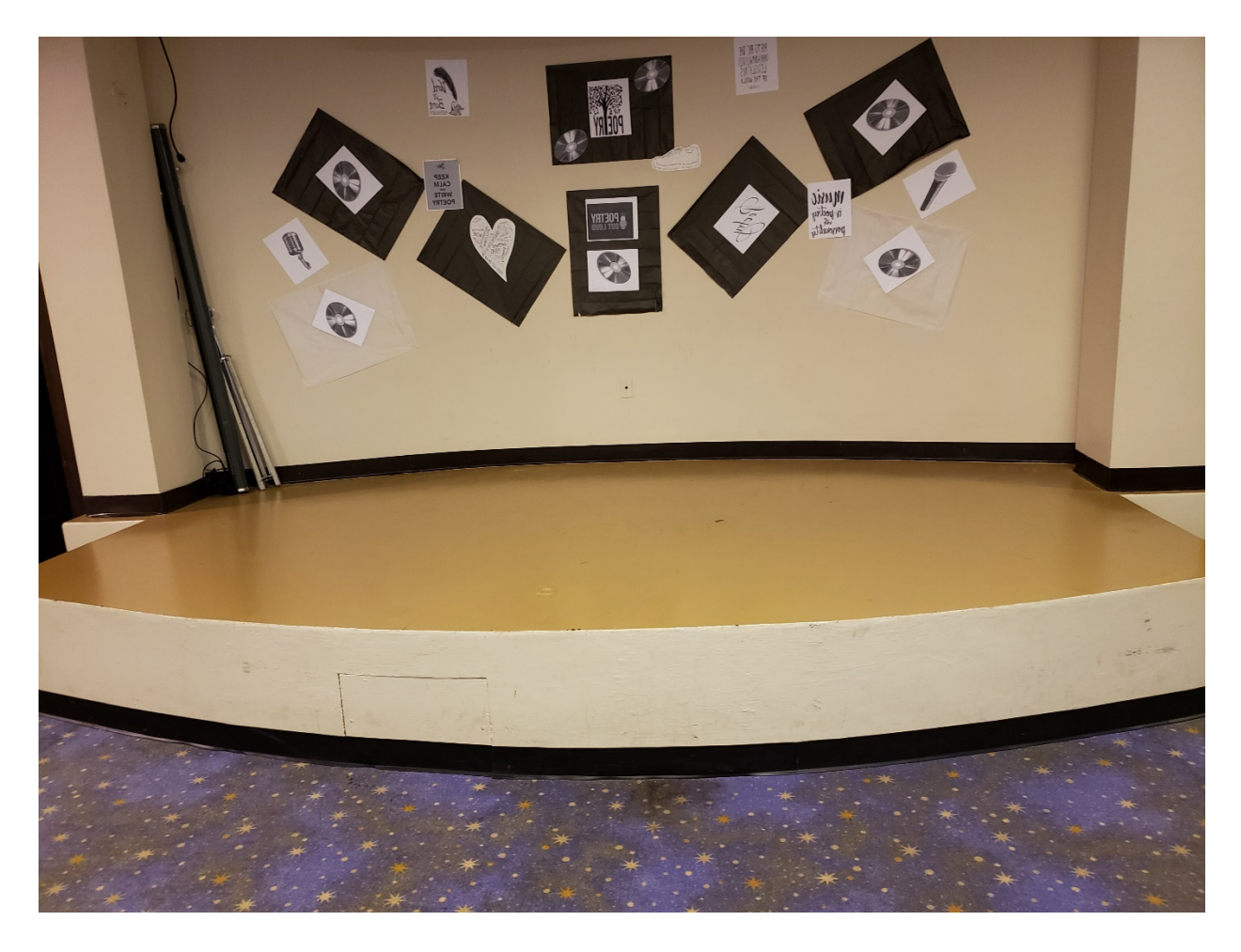
Just before Storytime begins, I sit down on the carpet in front of the stage.