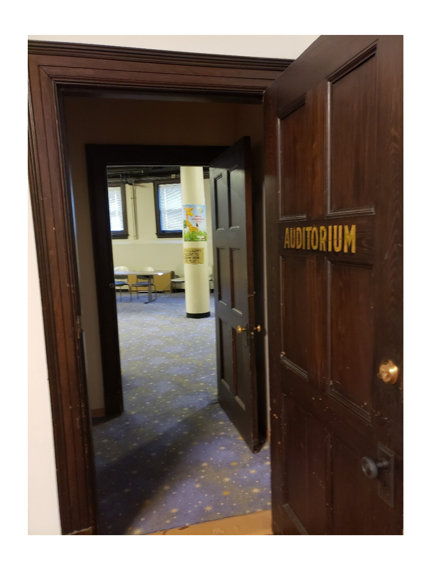
This is the Auditorium entrance.