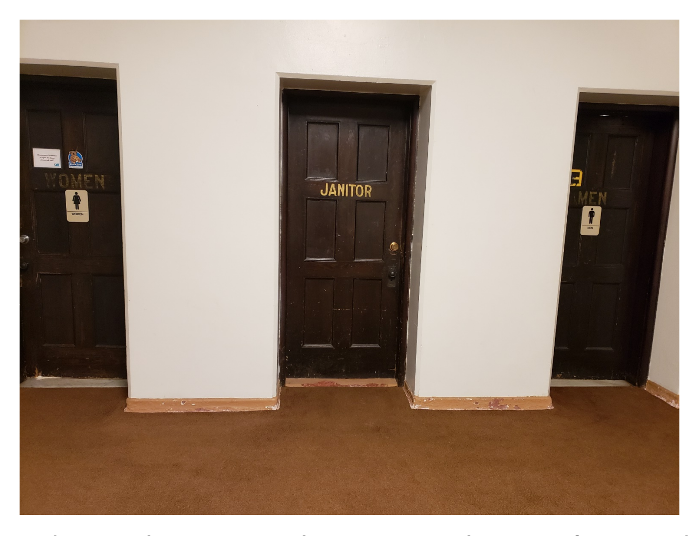
If I need to use the restroom, there is a special one just for me and my caregivers across from the Auditorium.