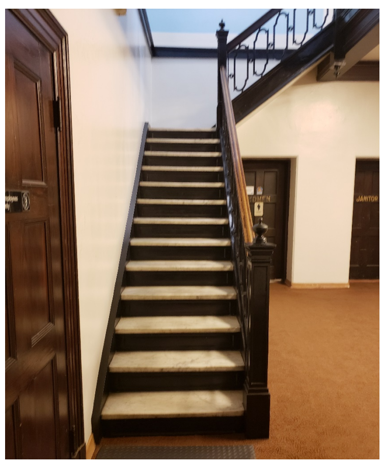
I go downstairs to Storytime in the Auditorium.