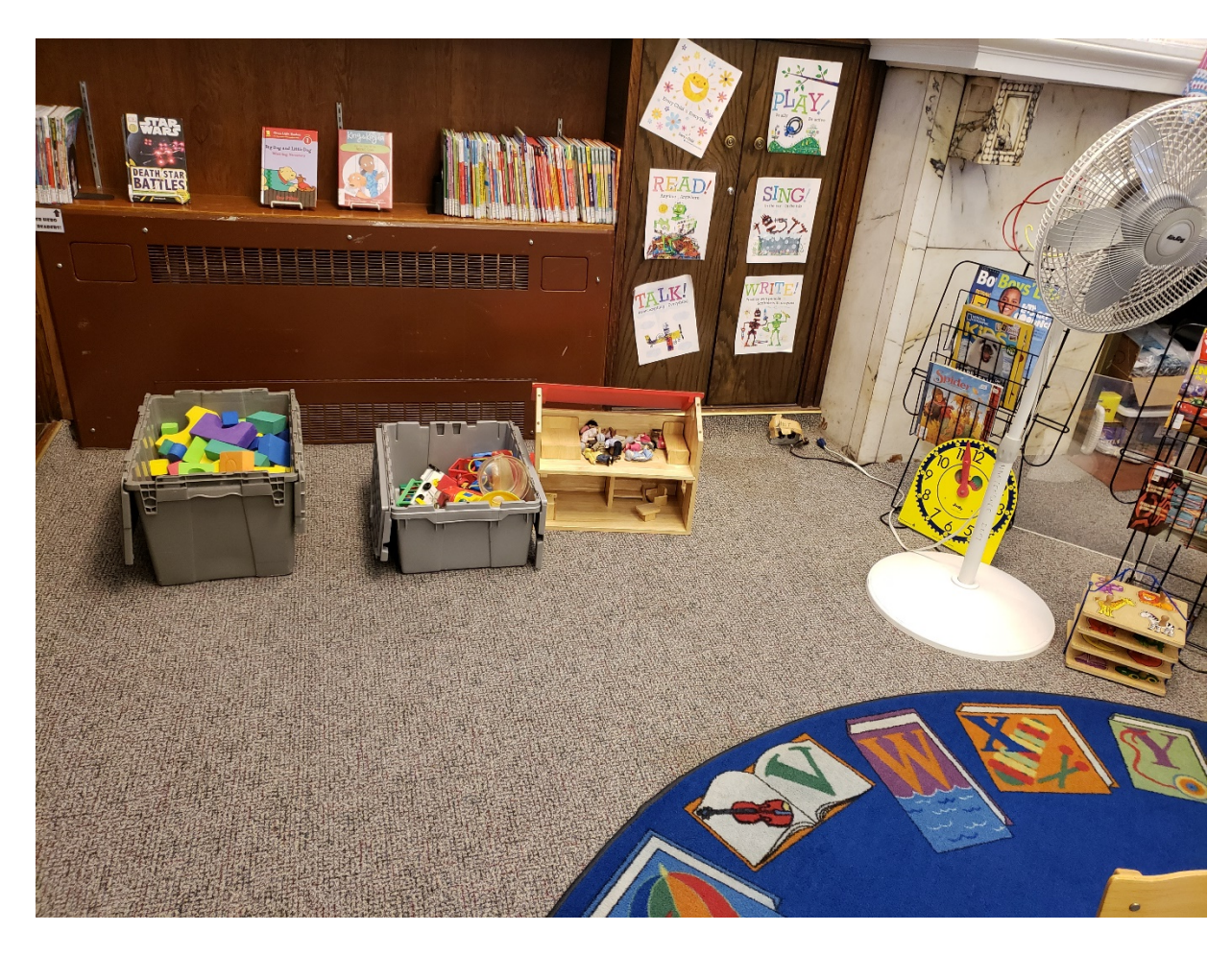
At the end of Storytime, if I want, I can stay to play with toys and the other children.