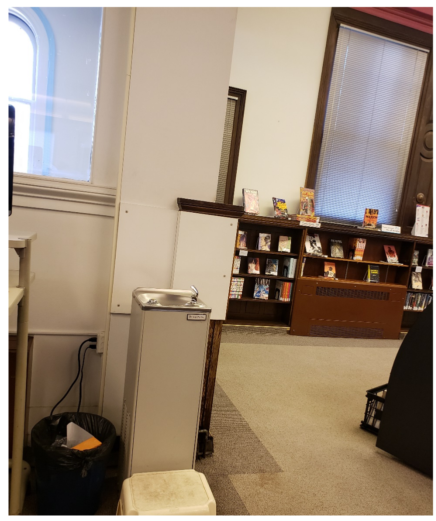
When I get thirsty, there is a water fountain upstairs next to the computer.