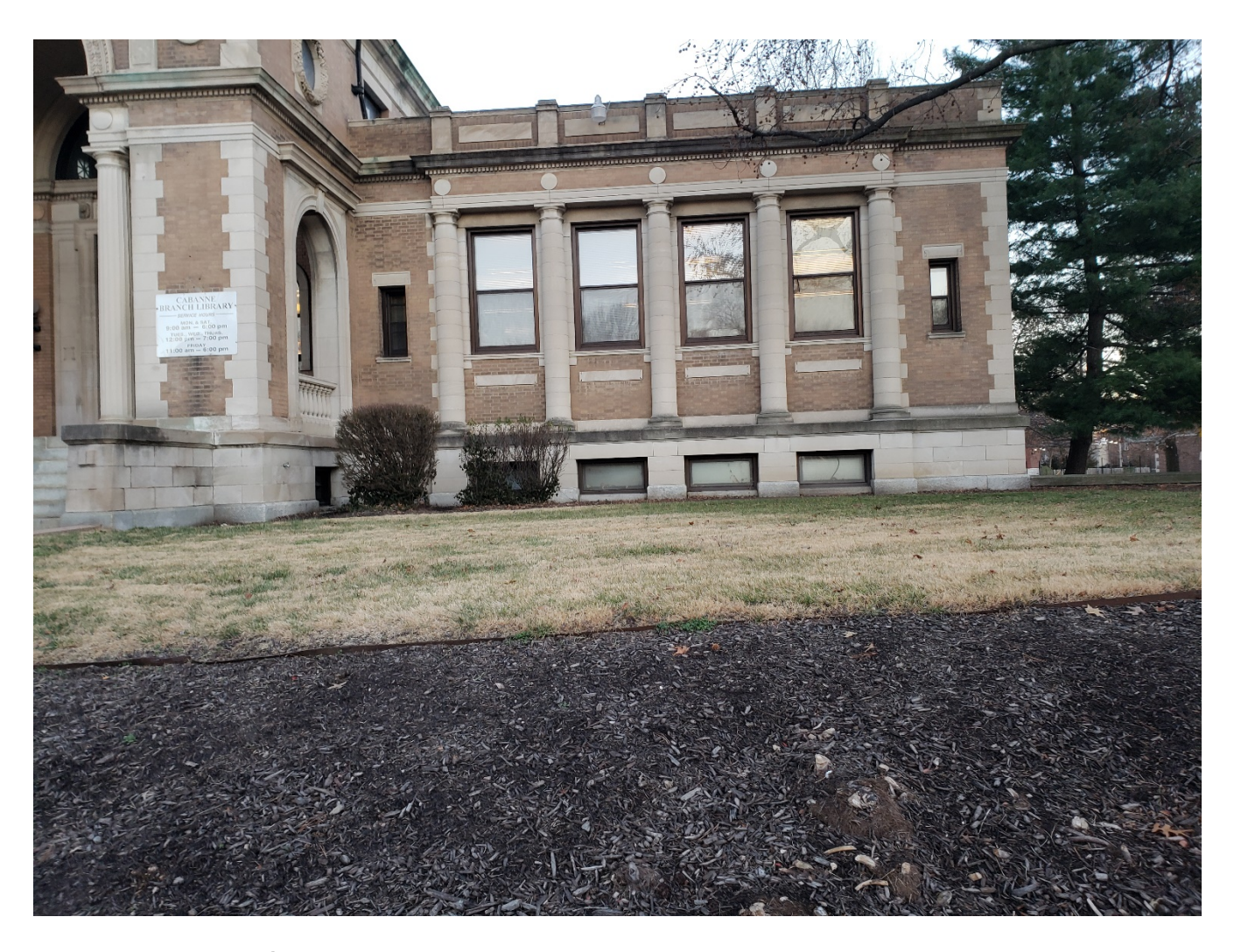
After Storytime is over, we all go home.